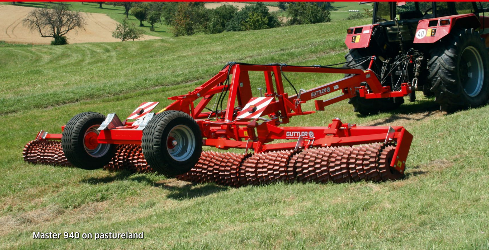
Master 940 on pastureland