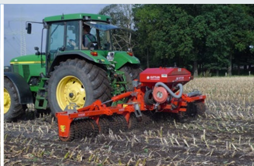
Combating European corn borer