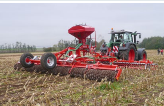
Combating the European corn borer

As well as pastureland maintenance in spring, we have also provided a service since 2009 to control European corn borer, while at the same time establishing autumn cover crop. The machines are working very well. We can manage several hundreds of hectares a year per machine.”