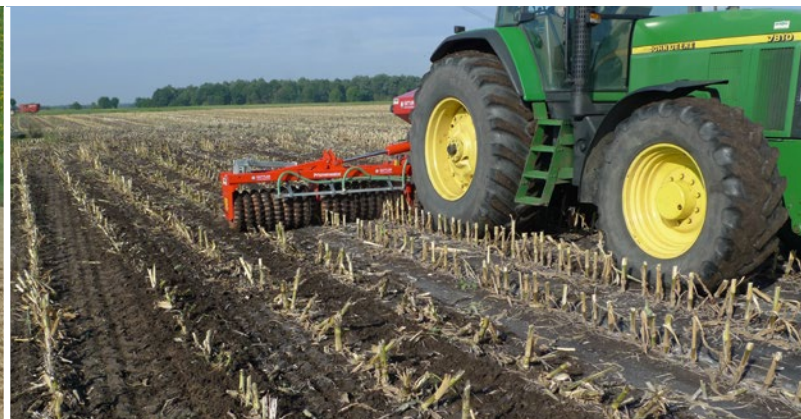
Combat European corn borer much more effectively, using less fuel. Corn stubble is folded and broken.