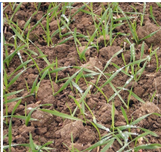
Cultivate triticale with the GreenMaster