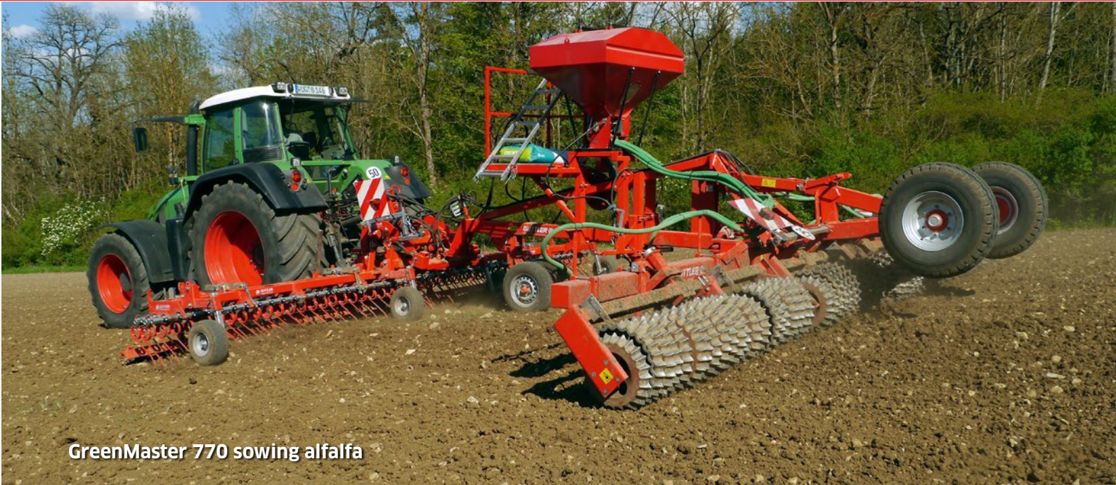
GreenMaster 770 sowing alfalfa