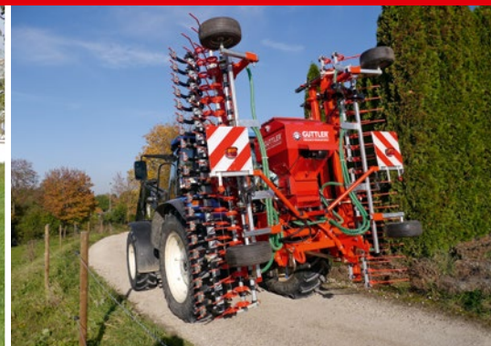
Seeder with step