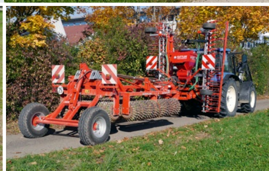
2.5 m transport width