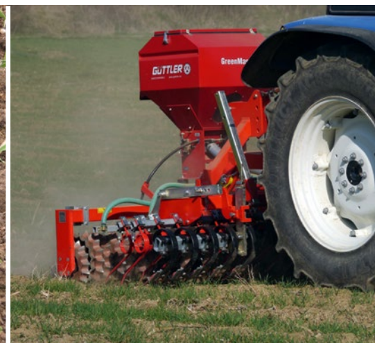
Establish undersown crops in autumn or spring cereals and in addition stimulate growth