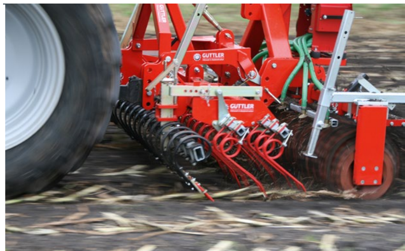
Combat European corn borer, establish winter greening