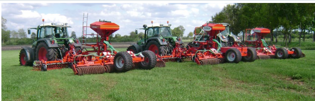
Three of the six GreenMasters owned by Hansa GmbH.