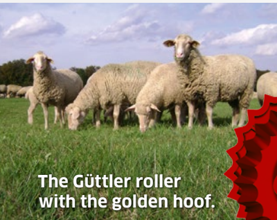
The Güttler roller with the golden hoof.