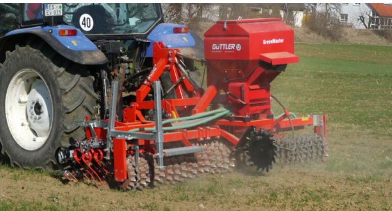
Stimulate winter seeds growth, establish undersown crops in spring cereals.