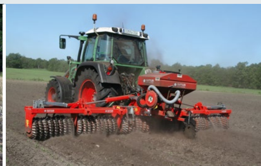
Undersown crops in maize or cereals, cultivate cover crops