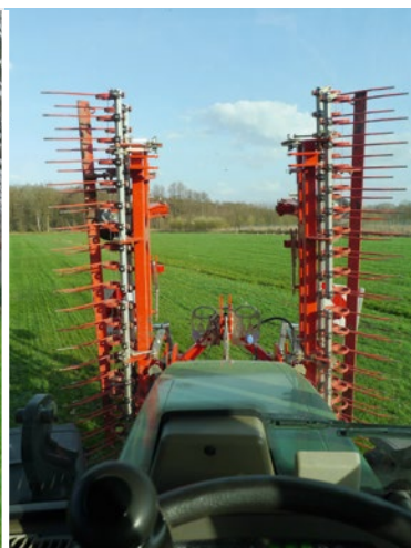
Transport positions: Field of view approx. 120 cm wide