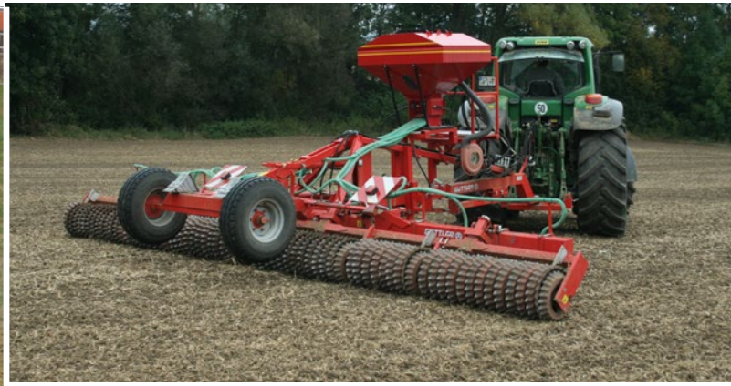
Roll before and after seeding.