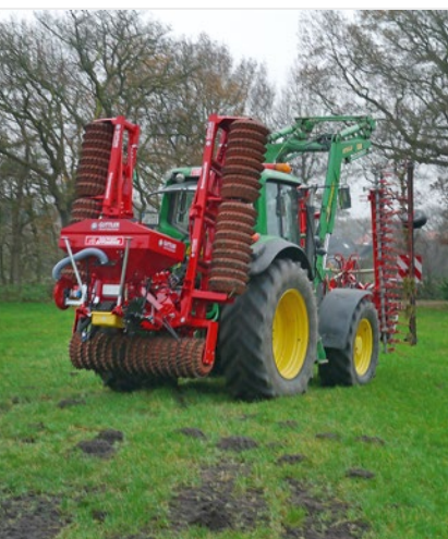
Balanced weight distribution