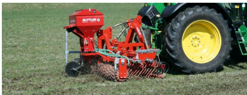
Distributing manure using the GreenMaster 300