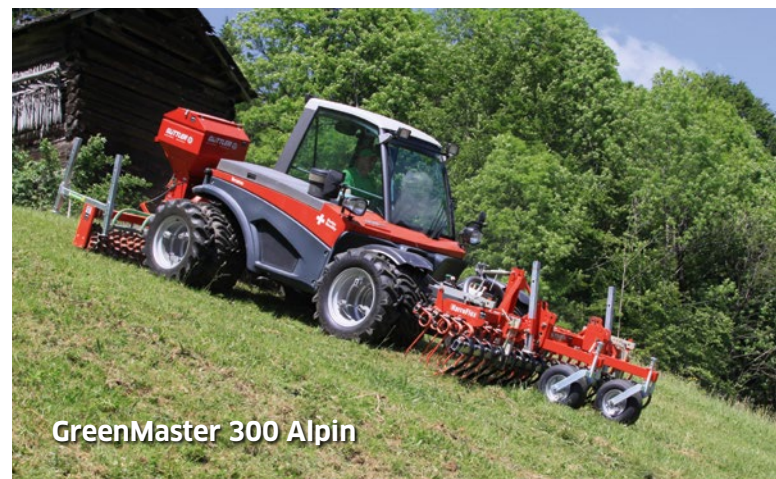
GreenMaster 300 Alpin

For example: With a seed rate of 5 kg/ha of rye grass and a thousand seed weight of 2.5 g, you will have at least 200 seeds per square metre.