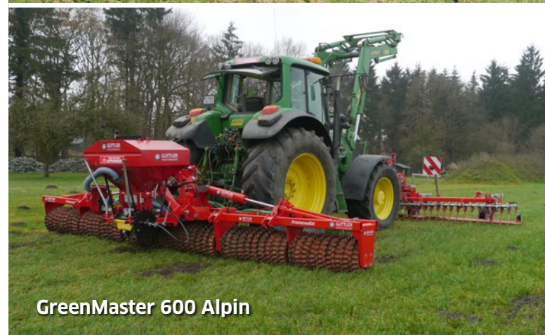
GreenMaster 600 Alpin