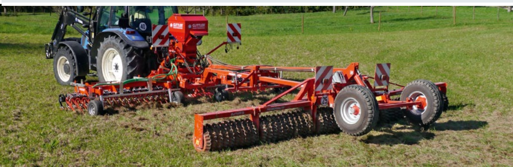
GreenSeeder 600 with Mayor 640 attached / 100 bhp tractor