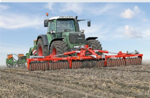
For maize seed in the front